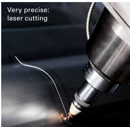
Very precise: laser cutting

Serbia: Gas supply system for wine producer