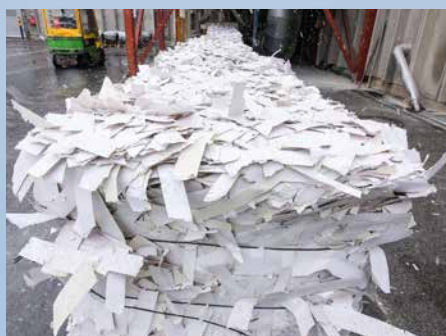
Large bales of waste paper are recycled to produce cardboard.