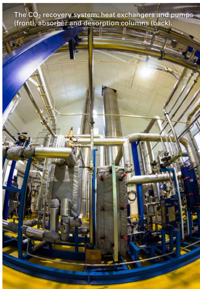
The CO 2 recovery system: heat exchangers and pumps (front), absorber and desorption columns (back).

Simone Hirt, ASCO Carbon Dioxide Ltd, and Reiner Knittel, Messer Schweiz AG