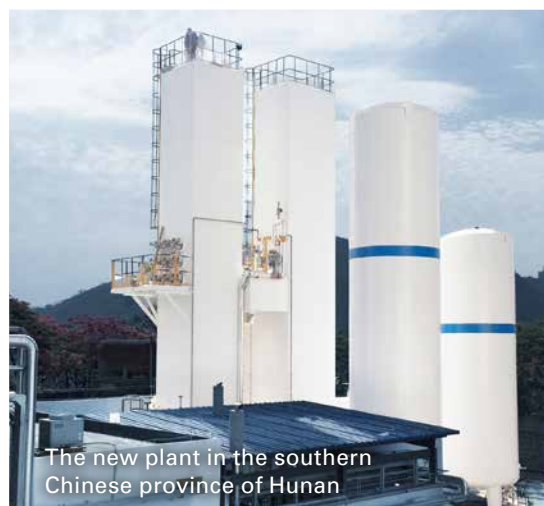
The new plant in the southern Chinese province of Hunan