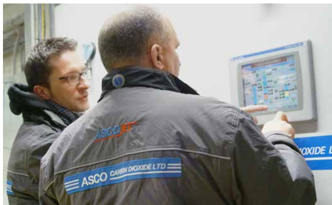
The ASCO engineers ensure smooth operation of the system by carrying out regular maintenance.