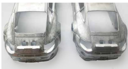
The difference between before and after can be seen clearly on the bodywork of these model cars.