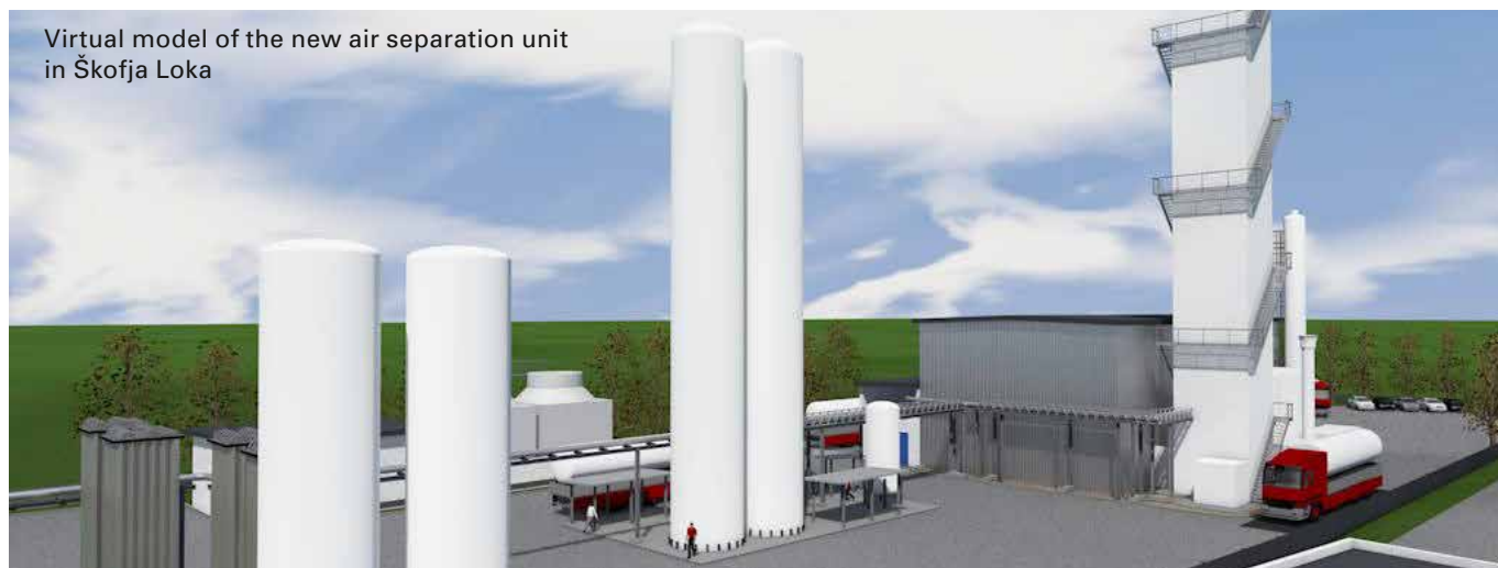
Virtual model of the new air separation unit in Škofja Loka