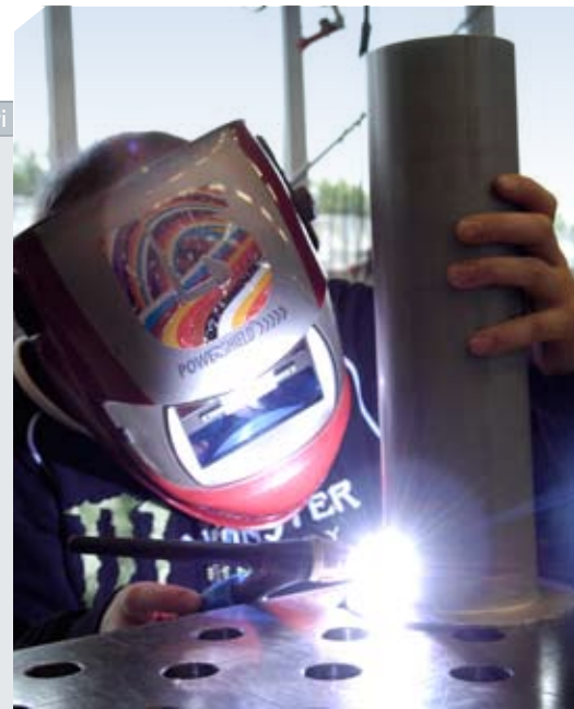
Welding with Inoxline He3 H1

Ochri: The welding gas costs are of secondary importance as far as we