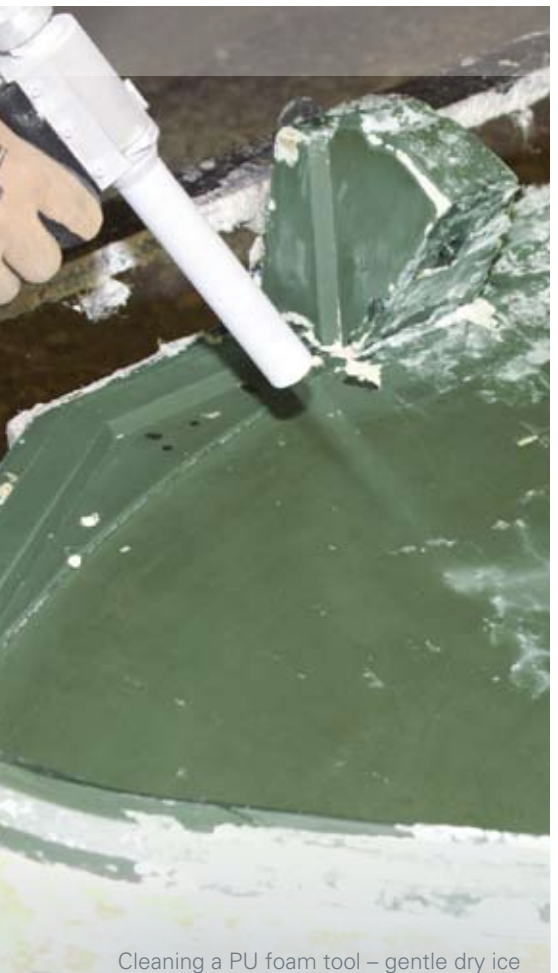
Image: Constraint of the manufacture of upholstered furniture, AsCOJET dry ice blasting technology is used to clean PU foam tools. Andrea Launer, responsible for Internal Communications at Messer, briefly swaps her desk chair for a comfortable sofa in

Cleaning a PU foam tool – gentle dry ice cleaning ensures reduced tool wear